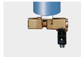
Option: Purge stop valve

the desired pressure dew point. In the model HMM, the membrane bundle is located in a pressure-resistant housing. This construction offers the possibility to interrupt the purge air flow by means of an optionally-mounted solenoid valve, which can be operated from the compressor on-off contact.